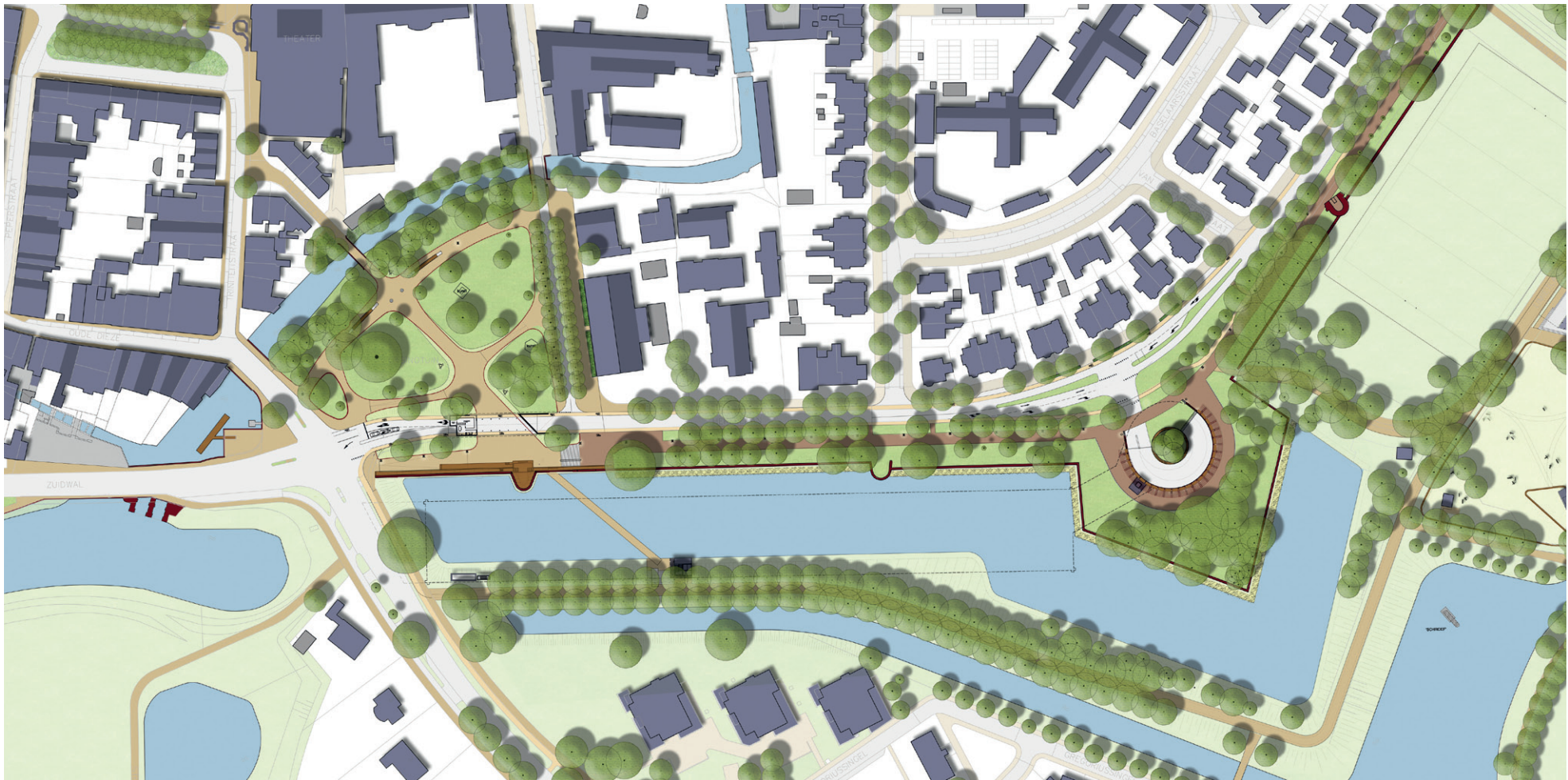
map design ▲