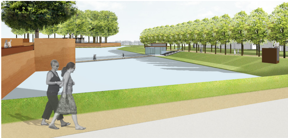
◀ ▲ visualistions design