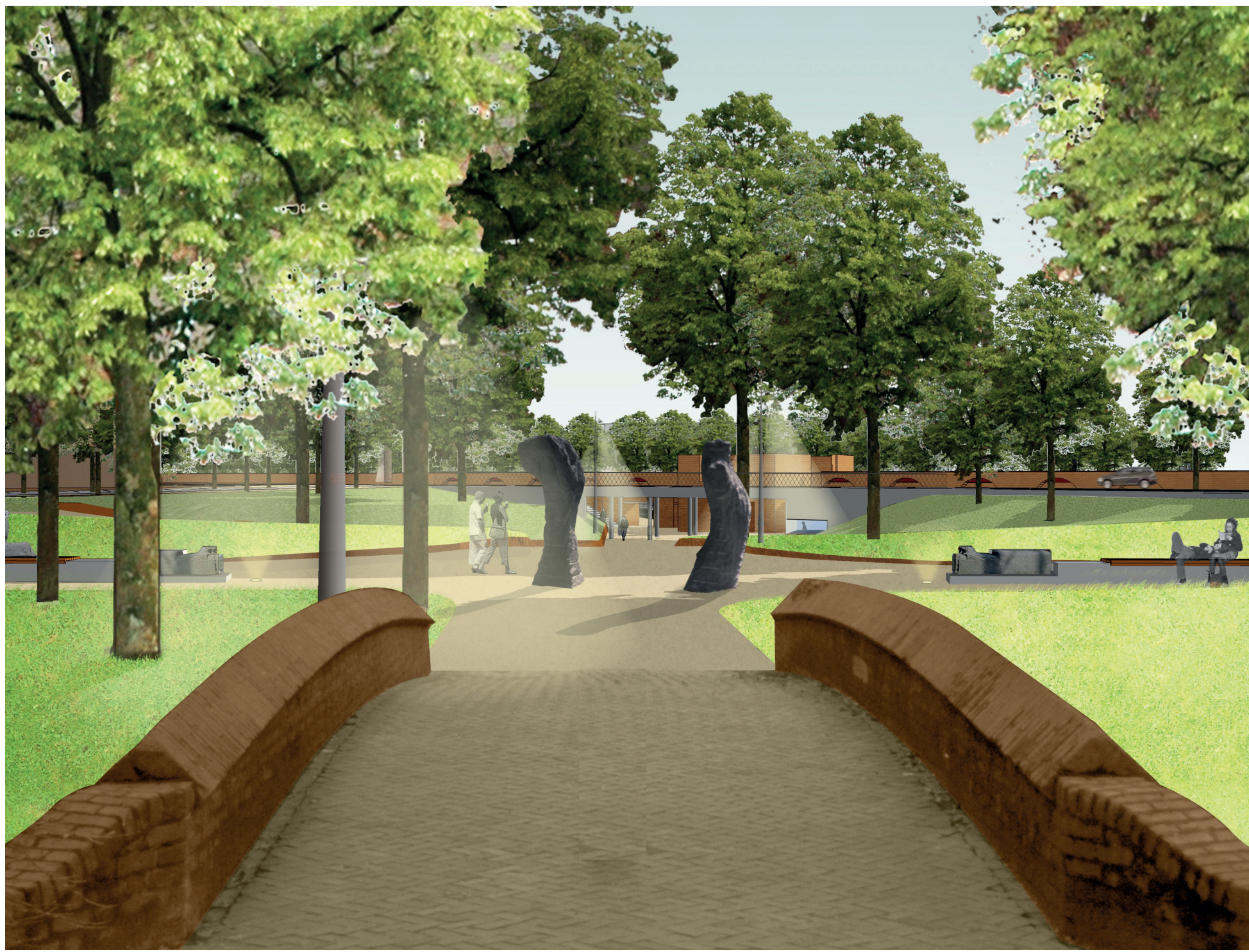
RAMPART ZONE DEN BOSCH